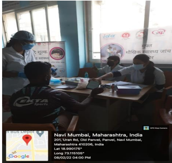
TEAM MEMBERS AT THE CAMP SITE

Bus Depot Navi Mumbai, Maharashtra, India 201, Uran Rd, Old Panvel, Panvel, Navi Mumbai, Maharashtra 410206, India Lat 18.990175° Long 73.115105° 08/02/22 04:00 PM